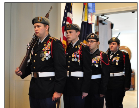
South Fork High School Color Guard