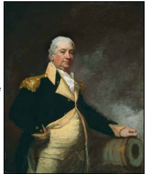
"General Henry Knox" by Gilbert Stuart c.1805, Museum of Fine Arts, Boston.

In August 1782, Knox became commander of the facilities at West Point.