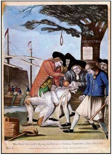
The Bostonians Paying the Excise-man, or Tarring and Feathering by Philip Dawe, 1774, from John Carter Brown Library, Brown University

-- (...) Wonderful is the effect of impudent & persevering lying. The British ministry have so long hired their gazetteers to repeat and model into every form lies about our being in anarchy, that the world has at length believed them, the English nation has believed them, the ministers themselves have come to believe them, & what is more wonderful, we have believed them ourselves. Yet where does this anarchy exist? Where did it ever exist, except in the single instance of Massachusetts? And can history produce an instance of rebellion so honourably conducted? I say nothing of it's motives. They were founded in ignorance, not wickedness. God forbid we should ever be 20 years without such a rebellion. The people cannot be all, & always, well informed. The part which is wrong will be discontented in proportion to the importance of the facts they misconceive. If they remain quiet under such misconceptions it is a lethargy, the forerunner of death to the public liberty.