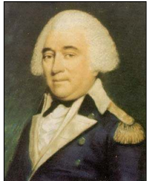
"Anthony Wayne, uniform" by James Sharples

In 1781, Wayne was commanding officer of the Pennsylvania line when conditions led to the Pennsylvania line mutiny, a serious issue only resolved by dismissing half the troops. After delays replenishing the ranks and dealing with subsequent complaints about devalued pay, Wayne joined Lafayette in Virginia. After the British surrender at Yorktown, Wayne was sent to South Carolina and then Georgia to break the British alliance