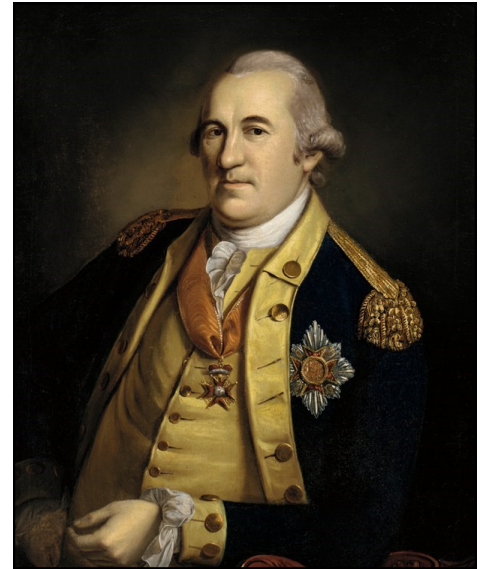
"Baron Friedrich Wilhelm von Steuben" by Charles Willson Peale

In November 1780, von Steuben was sent to Virginia to mobilize forces in