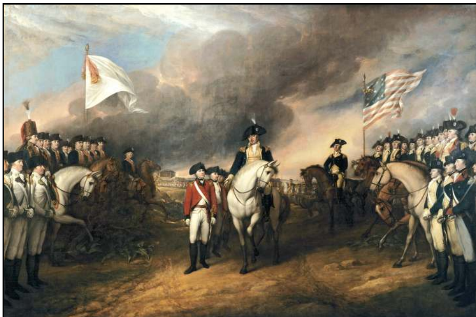
"Surrender of Lord Cornwallis" by John Trumbull, displayed in the United States Capitol Rotunda. General Benjamin Lincoln is the central figure.

Lincoln was appointed commander of the Southern Department in September 1778. In October 1779, Lincoln partnered with French ships and troops under Vice Admiral Comte d'Estaing to lay siege to Savannah, Georgia. American forces attacked, but were unable to break British defenses. The siege failed as d'Estaing departed rather than risk his ships during the hurricane season. Lincoln removed his command to Charleston, South Carolina. The city of Charleston came under attack in March 1780 by British forces from New York under Lieutenant General Sir Henry Clinton. With Charleston under siege, Lincoln attempted to negotiate the evacuation of the city, and later attempted to negotiate a surrender. On May 12, 1780, Lincoln was forced to unconditionally surrender, being denied the traditional honors of war by Clinton. Surrendering over 5000 men, the loss was one of the worst Continental defeats of the war.