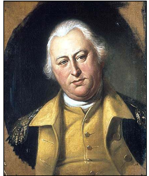
"Benjamin Lincoln" by Charles Willson Peale

In July, Lincoln was sent to General Philip Schuyler to defend upstate New York against an advance by General John Burgoyne from Quebec. Lincoln coordinated the New England militia, including those under General John Stark, who refused to place his forces under Lincoln's command, having resigned his continental commission over a perceived promotional slight. Stark won a victory at the Battle of Bennington operating independently. Schuyler was replaced by General Horatio Gates, who ordered Lincoln's force to join him as Gates' army fought the Battles of Saratoga. Gates dismissed General Benedict Arnold after the Battle of Freeman's Farm and Lincoln was placed in command of the army's right. At the Battle of Bemis Heights, Lincoln was in command of defenses as