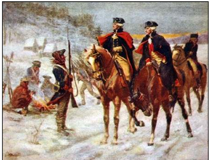
"Washington and Lafayette at Valley Forge" By John Ward Dunsmore