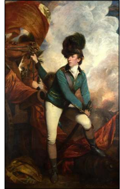
"Portrait of Sir Banastre Tarleton" By Joshua Reynolds

Daniel Morgan died July 6, 1802 at Winchester, Virginia on his 66th birthday.